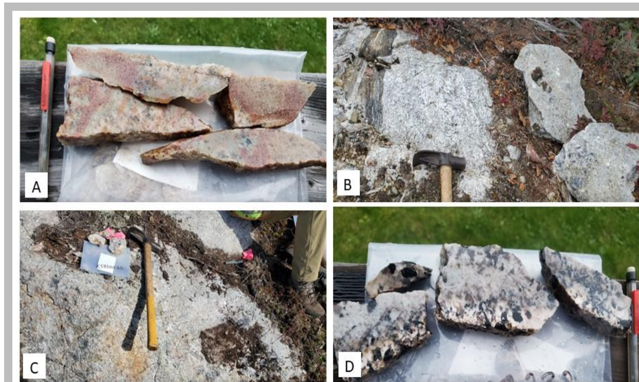
Figure 1. Field mapping photo's taken by EGS. A) Bands of red garnets in pegmatite. B) Grey pegmatite in contact with Jubilee metasediments. C) Grey pegmatite dyke. D) Tourmaline crystals within a white pegmatite.